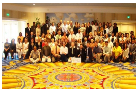
A Class Picture of conference attendees in Orlando.

The National Association of Youth Courts, along with the Florida Association of Teen Courts, held our 2009 Annual Conference in Lake Buena Vista, FL from November 8-11. Over 110 attendees participated in this outstanding event that covered a diversity of topics from starting a youth court to building support for existing programs. Delegates from 24 states were in attendance...along with one international visitor from Japan!